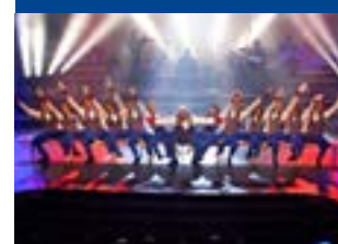
THE "IT" SHOW