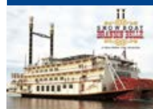
THE SHOWBOAT BRANSON BELLE