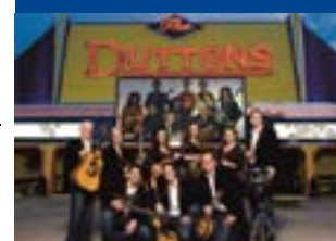
THE DUTTON FAMILY SHOW