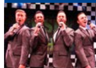
NEW JERSEY NIGHTS SHOW