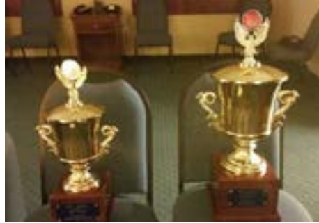
First Place Division 2 Color Guard Second Place Division 2 Yacht Club Float