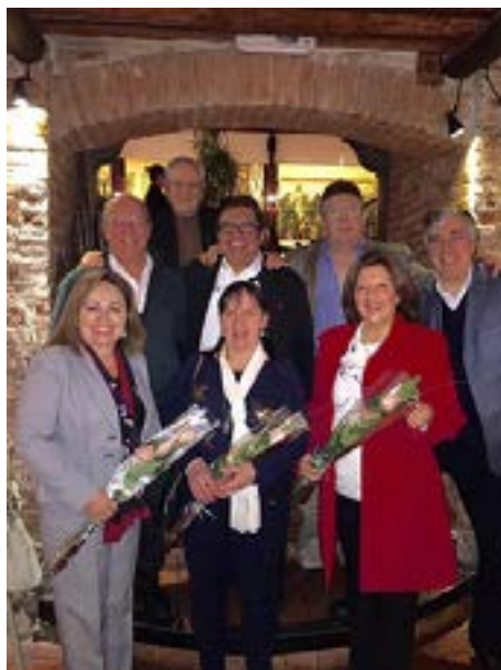
Potentate's Uruguay Trip