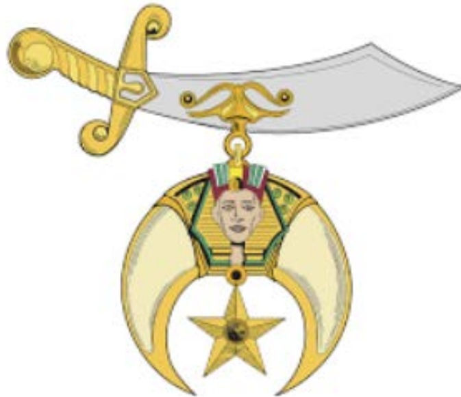
The Shrine Emblem

The Crescent was adopted as the Jewel of the Order. Though any materials can be used in forming the Crescent, the most valuable are the claws of a Royal Bengal Tiger, united at their base in a gold setting. In the center is the head of a sphinx, and on the back are a pyramid, an urn and a star. The Jewel bears the motto “Robur et Furor,” which means “Strength and Fury.” Today, the emblem includes a scimitar from which the crescent hangs, and a five-pointed star beneath the head of the sphinx.